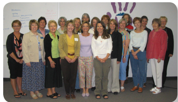
RAP workshop June 2007

In June 2007, thanks to a generous grant from The Sam Price Family Foundation, 18 teachers participated in HillSprings' first workshop for professional development. The Reading Achievement Program (RAP) is an adapted version of the highly successful, research based approach to teaching reading that was developed at The Hill Center in Durham, NC. It was specifically created as a tutoring model for students who are experiencing reading difficulties. Participants came from local school districts, private schools, Canon City, Delta and Boulder. Colorado participants were given all the materials that they needed to start teaching students immediately and HillSprings faculty helped many of them with follow up observations during the current school year. 🌱